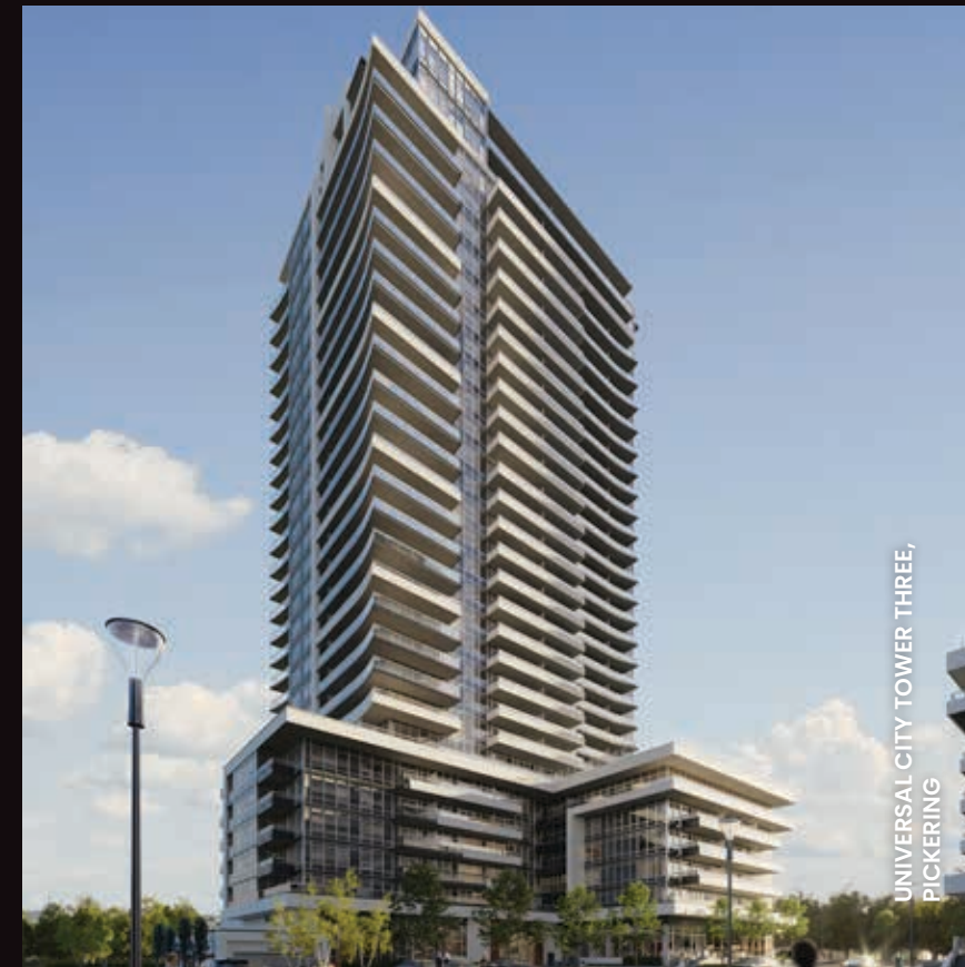
UNIVERSAL CITY TOWER THREE, PICKERING

Our vision for all communities includes meticulous attention to detail, superior features, exciting amenities, and excellent craftsmanship, using the latest in technology and design advancements. Success after success, count on Chestnut Hill for connected, contemporary living.