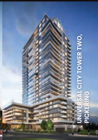
UNIVERSAL CITY TOWER TWO, PICKERING