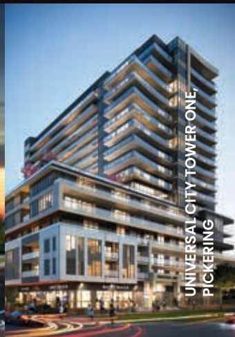
UNIVERSAL CITY TOWER ONE, PICKERING