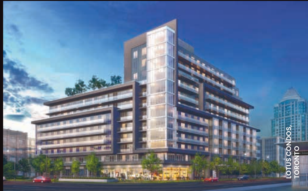
LOTUS CONDOS, TORONTO

At Chestnut Hill Developments, we create visionary communities that stand the test of time. Since 1981, our reputation for providing premium locations, brilliant design, and unprecedented value has earned us the trust of thousands of homeowners. Our track record of creating outstanding condominium projects throughout the gta is largely thanks to our precise understanding of the needs and wants of the community.