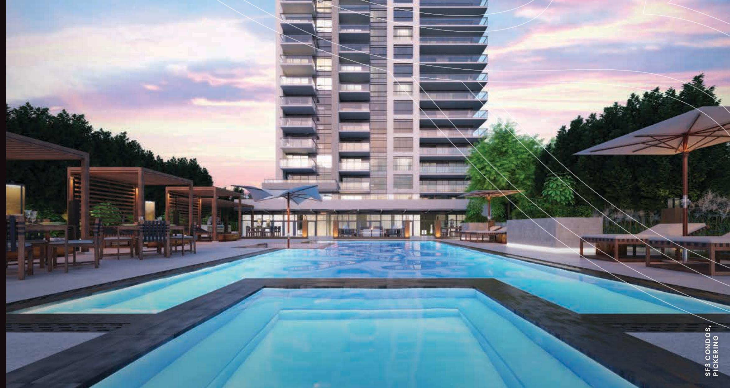
SF3 CONDOS, PICKERING