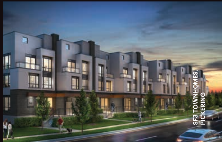
SF3 TOWNHOMES, PICKERING