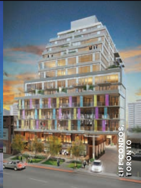
LIFE CONDOS, TORONTO